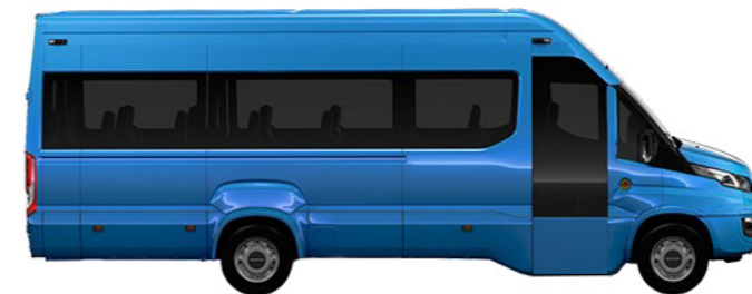
Iveco Daily 56C15