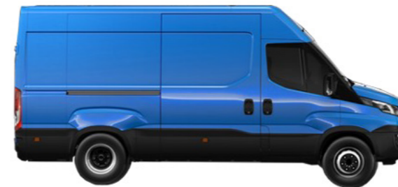
Iveco Daily 35S12V