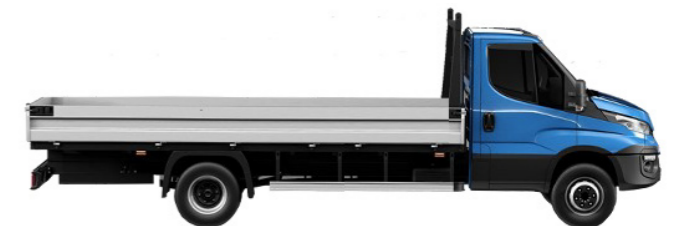
Iveco Daily 70C15