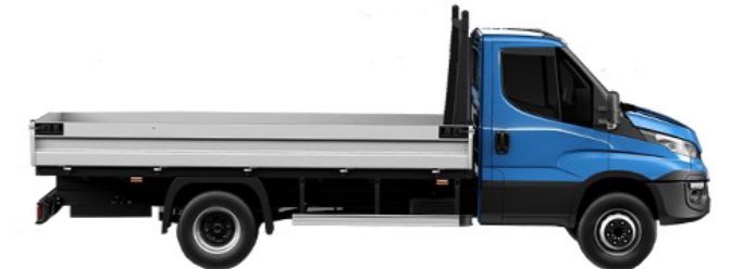
Iveco Daily 35S12